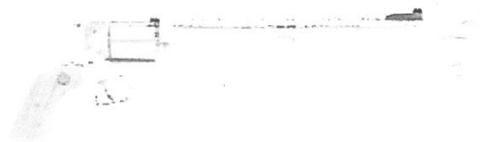
Ruger Super Blackhawk